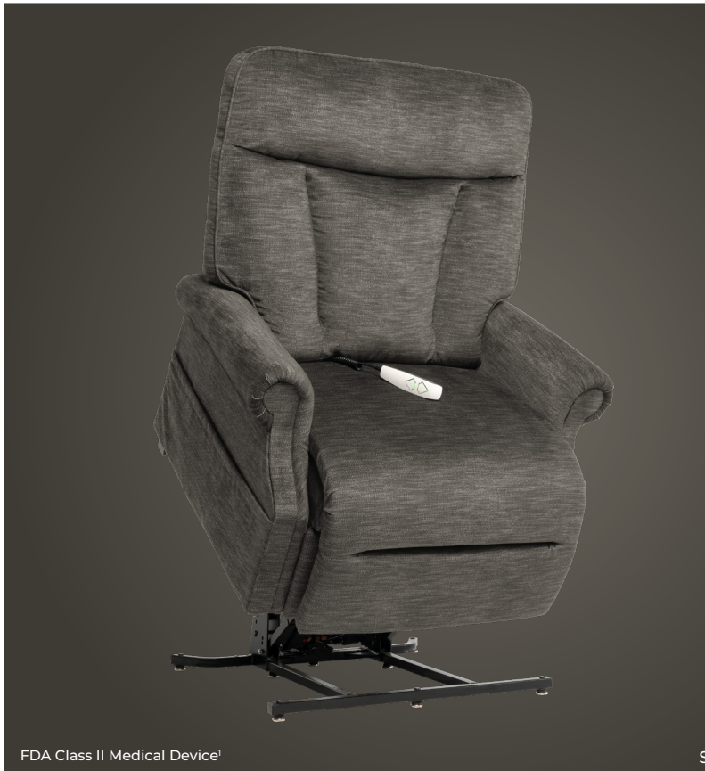
FDA Class II Medical Device 1