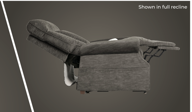
Shown in full recline